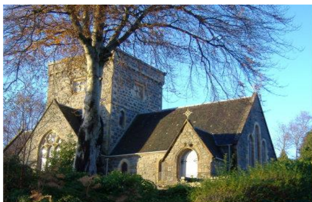
St. Oran's Church Connel

ARDCHATTAN linked with COLL linked with CONNEL